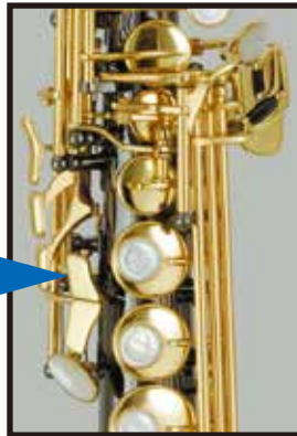
High G Key

Ribbed Construction Black Body . Lacquer Key W/ Two Necks KEY: Bb High: G Low: Bb High G Key